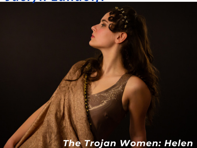
The Trojan Women: Helen