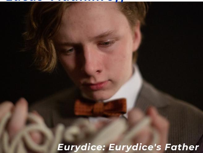
Eurydice: Eurydice's Father