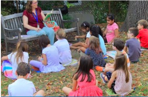
Elementary School Library