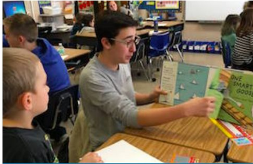
Middle & High School Library